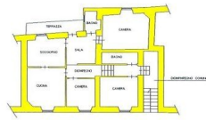
PIANTA PIANO PRIMO