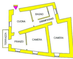
PIANO SECONDO H= 2.82m