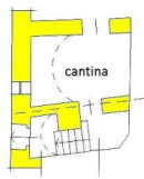
PIANO PRIMO SOTTOSTRADA