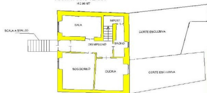
PIANTA PIANO TERRA