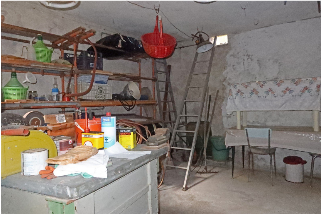
PIANO PRIMO SOTTOSTRADA